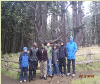
Top: WFI Fellows relax in the rustic ambiance of the Camp 18 restaurant.