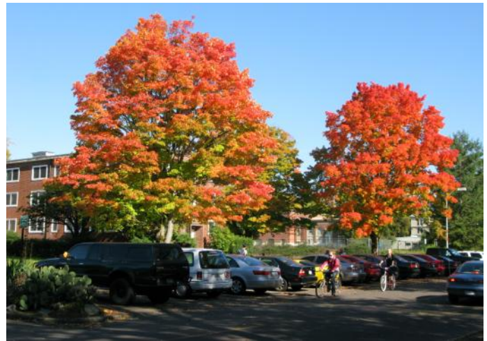
The OSU campus displays beautiful fall foliage at every turn this time of year.

ing is obvious when both the speaker and the audience can learn something new at each presentation. Copies of presentations can also be found on the OSU International Programs website here .